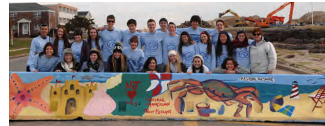
Belmar Barricades, Belmar Arts Council