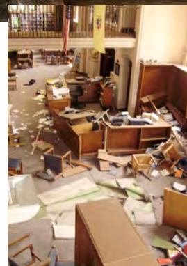
(top) Processing damaged records; (below) Morristown Public Library

Working closely with the New Jersey Office of Emergency Management (NJOEM), NJCAR has incorporated the State's cultural resources into the statewide Emergency Response Framework