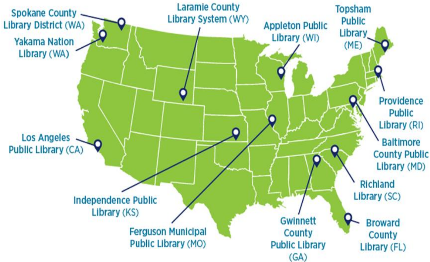
The Libraries Build Business Cohort